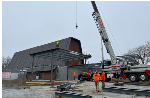
Signed by staff and building design committee members, the beam was lifted into place.

Do you see the white horizontal beam in the photo? That is the last beam put into place for our new South Entrance. It was installed on December 12 in a “Topping Off” ceremony, marking a significant step in our construction project. Our next short-term goal is to construct all the new exterior walls so that interior work may proceed during our cold winter months. Keep watching for more progress in the new year!